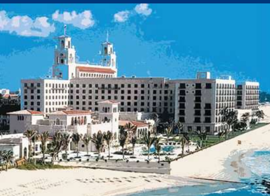
The Breakers, Palm Beach, Florida

The Florida Society of Anesthesiologists is an educational, research and scientific association of physicians organized to elevate and to maintain the standards of the medical practice of anesthesiology and to improve the care of their patients. Since its founding in 1948, the Society's achievements have made it an important voice in Florida medicine and the foremost advocate for all patients who require anesthesia or relief from pain. For more information about the society, please visit www.fsahq.org .