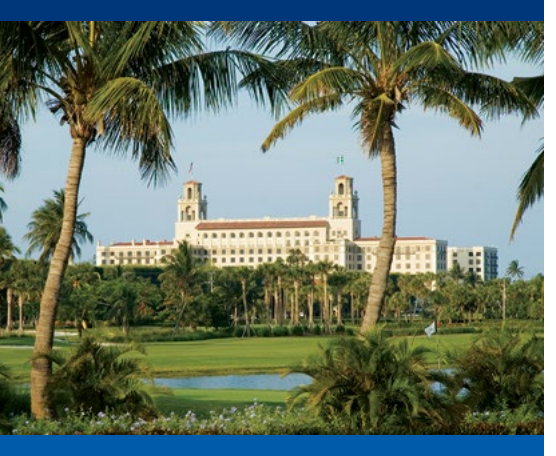
The Breakers, Palm Beach, Florida

The Florida Society of Anesthesiologists is an educational, research and scientific association of physicians organized to elevate and to maintain the standards of the medical practice of anesthesiology and to improve the care of their patients. Since its founding in 1948, the Society's achievements have made it an important voice in Florida medicine and the foremost advocate for all patients who require anesthesia or relief from pain. For more information about the society, please visit www.fsahq.org.